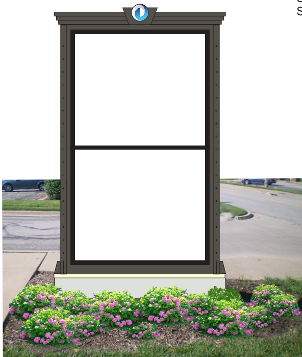
3' Landscaping by others