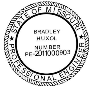
Bradley Huxol, PE