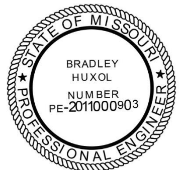
Bradley Huxol, PE