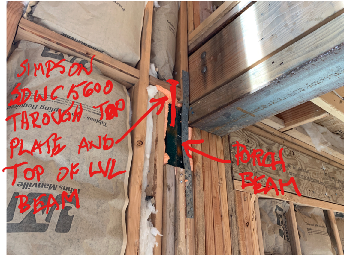
Alternate Connection (Figure 3)