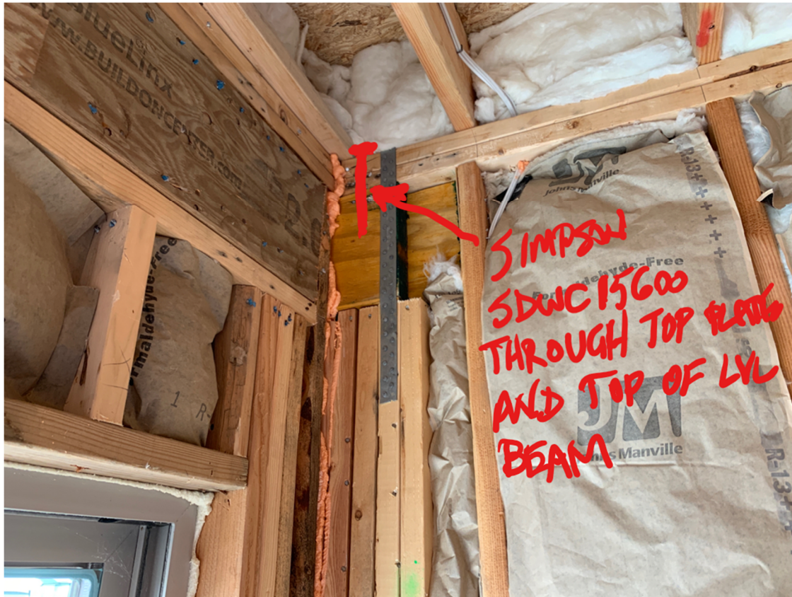
Alternate Connection (Figure 2)