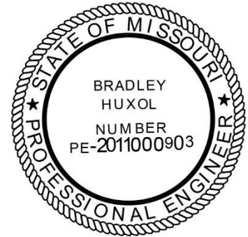
Bradley Huxol, PE