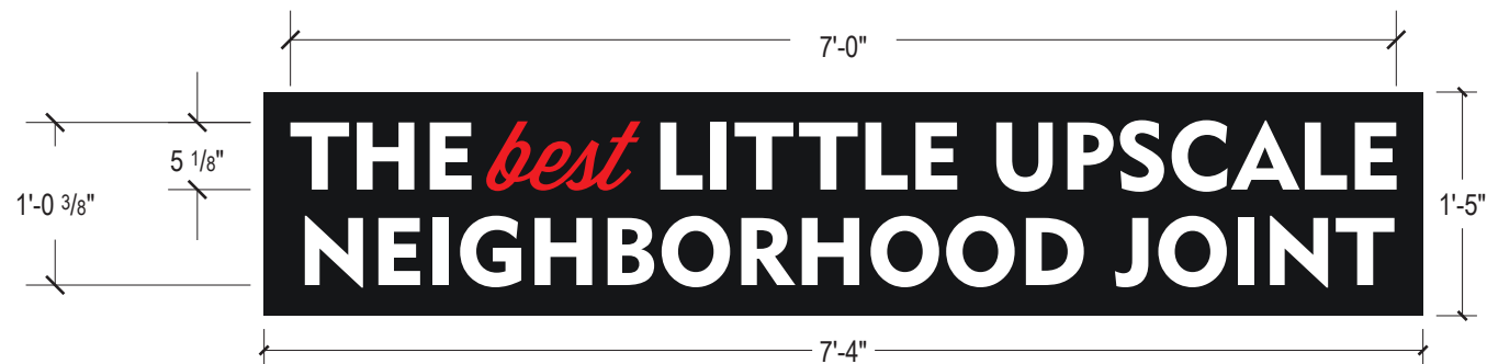
B 7 - FCO Tag Line Over Entrance scale: 3/4" = 1'-0"