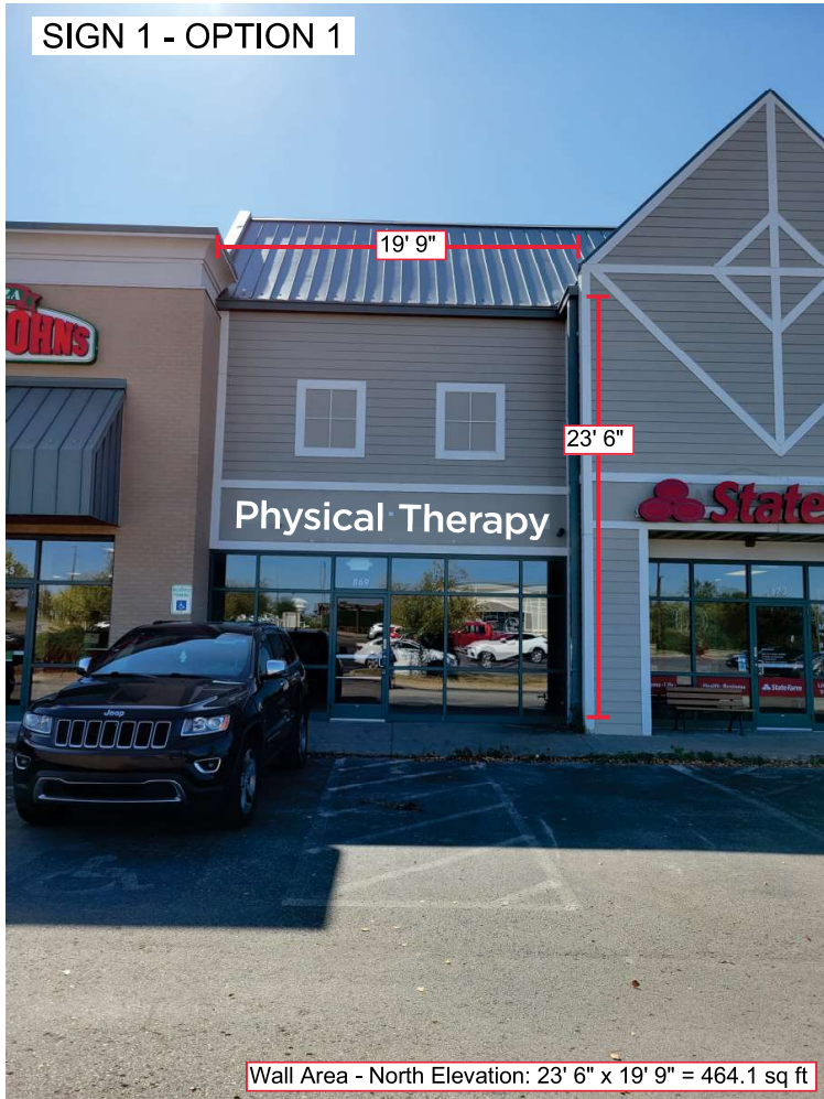
SIGN 1 - OPTION 1

Wall Area - North Elevation: 23' 6" x 19' 9" = 464.1 sq ft