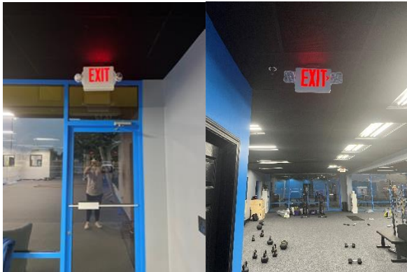
1213 NE Rice Road (Front)