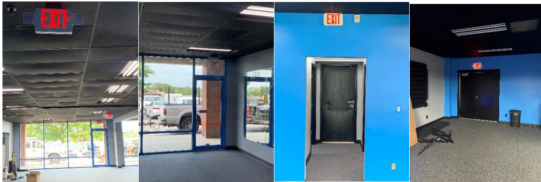
1215 NE Rice Road (Front)