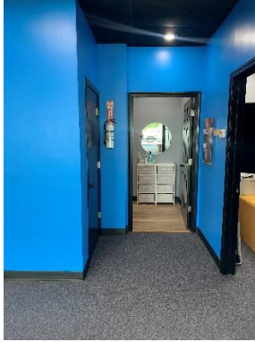
Fire Extinguisher (5lb 2a10bc)