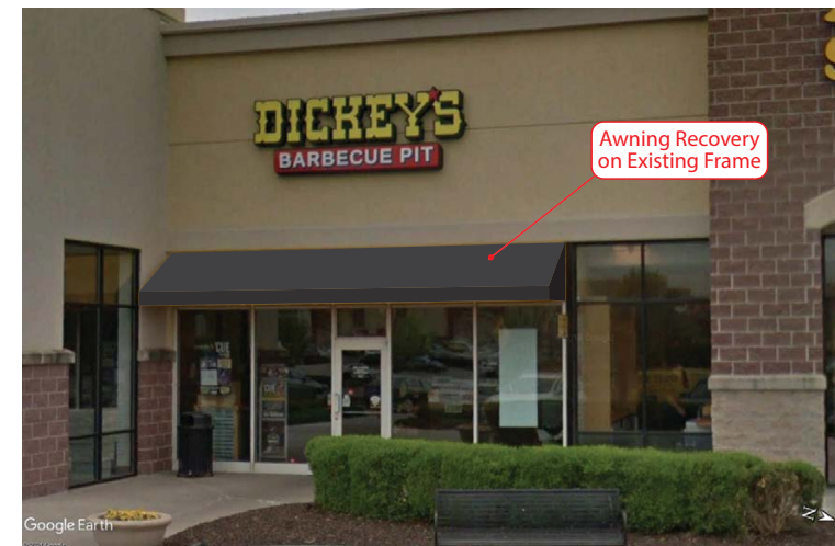
1.4 Awning Recovery on Existing Frame Scale : NTS Material: Sunbrella Black Dimensions to be field verified