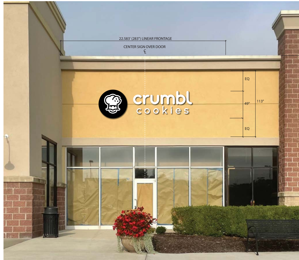
1.3 Front Elevation Scale : 1/8" = 1'-0"