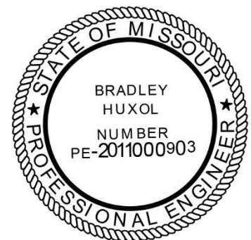
Bradley Huxol, PE