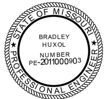
Bradley Huxol, PE