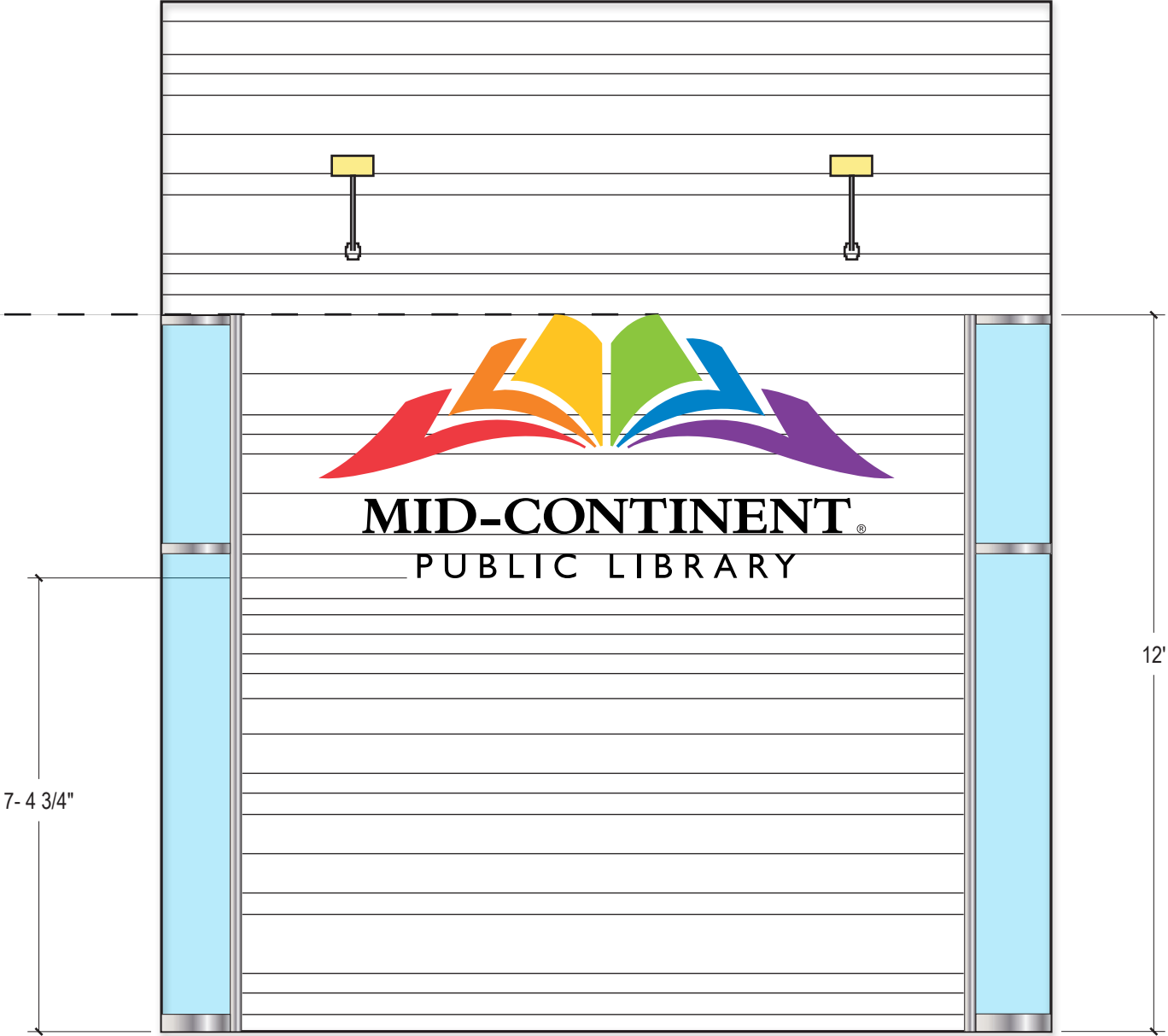
A MCPL Logo South Facade Elevation

Align top corners with top of adjacent storefront window