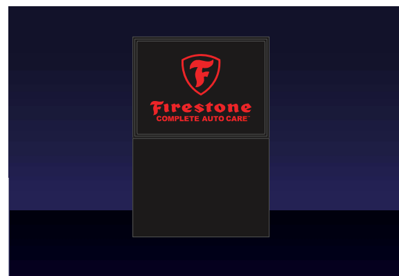
NIGHT ILLUMINATION VIEW

WALL STEEL SUPPORT REQ'D. - SIZE & LENGTH VARIES PER LOCAL CODE