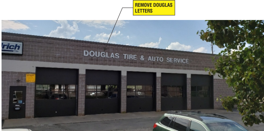
1 EXISTING LAYOUT NTS