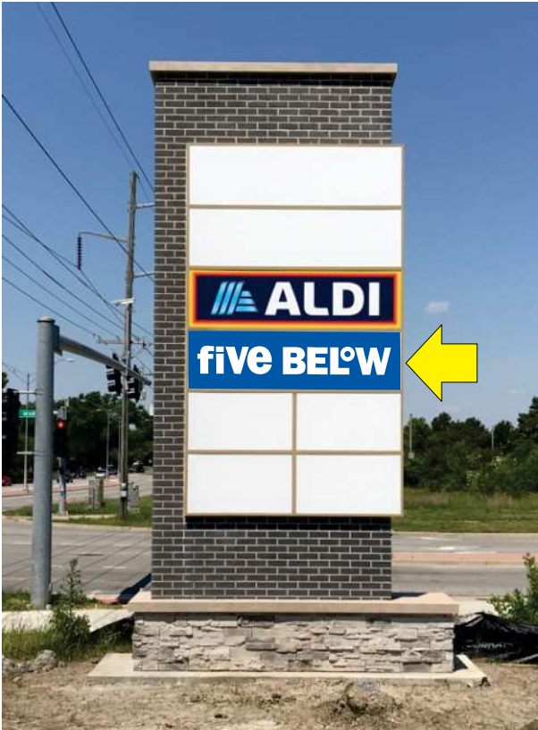
MULTI-TENANT PYLON SIGN