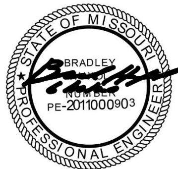
Bradley Huxol, PE