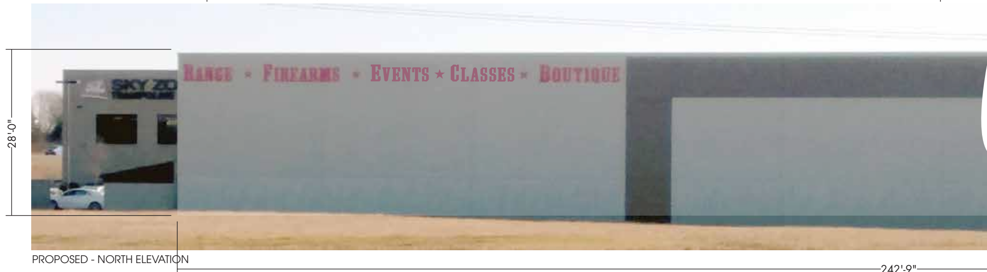
PROPOSED - NORTH ELEVATION 242'-9"