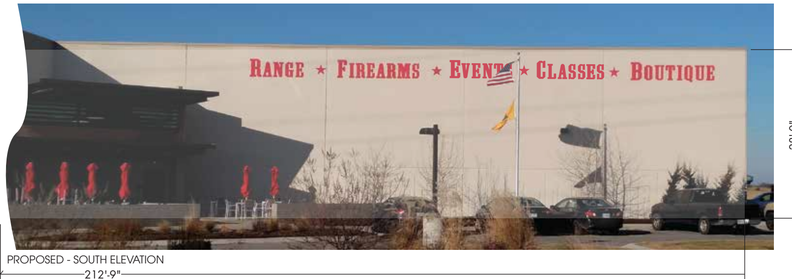
PROPOSED - SOUTH ELEVATION 212'-9"