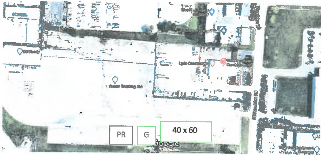
Map data ©2020 100 ft