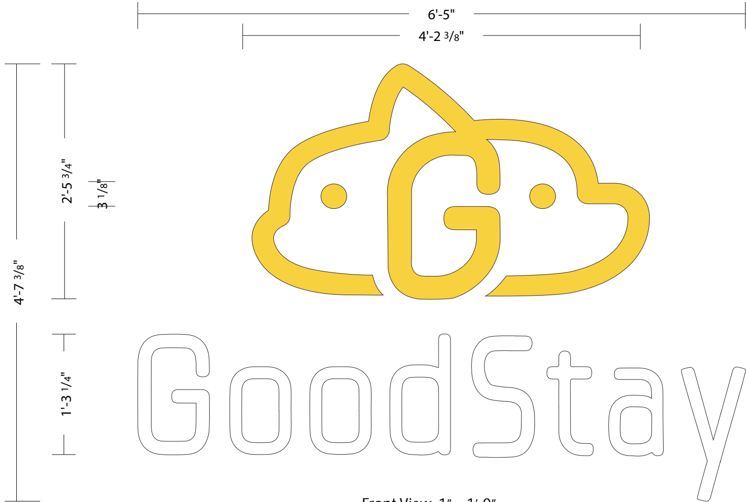
Front View 1" = 1'-0"