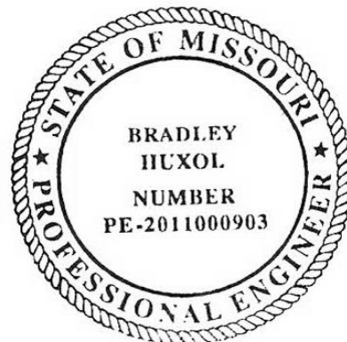
Bradley Huxol, PE